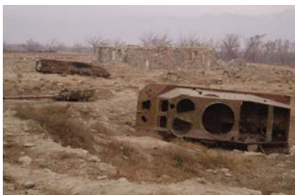
The remnants of war (just outside Kabul)

My visit to Kabul with PAI earlier this year was not my first. In 2004, I carried out a short visit for a few weeks when managing a project in the Ministry of Agriculture. I was excited as well as naturally apprehensive about visiting such a fascinating and culturally rich country again. I feel that the collapse of the Taliban in 2001, coupled with a more committed international involvement in the recovery of Afghanistan, brings a new hope to its beleaguered people, with a real chance of peace following nearly a quarter of a century of war.