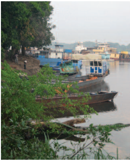
The banks of the river Nile in Juba

In a referendum held in January 2011, 99% of the people of Southern Sudan voted in favour of secession. If all goes to plan, Southern Sudan will become a new, independent African country in July 2011.